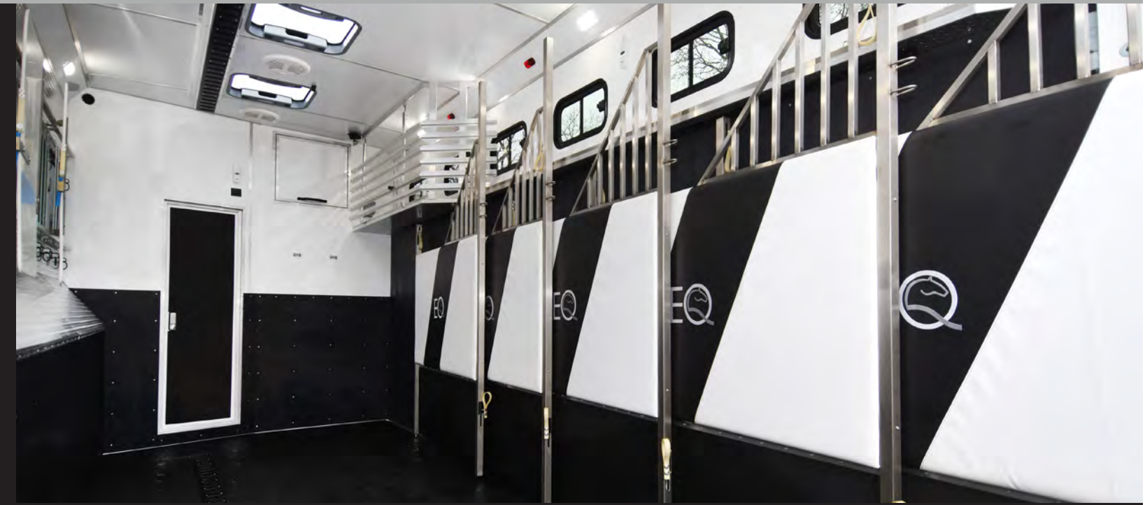
Large, clean, bright and spacious horse area with padded partitions