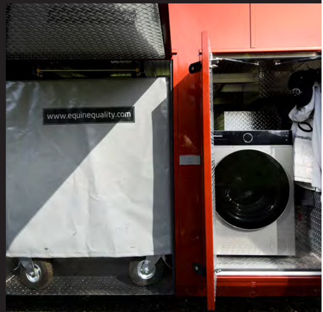
Slimline tack lockers in horse area designed to maximise space for saddles