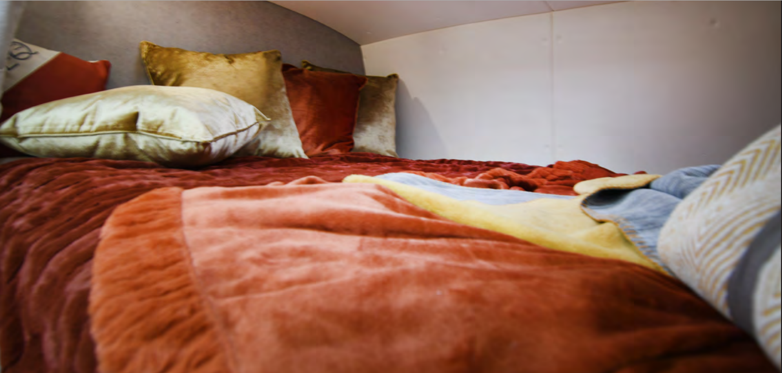
Beautiful living, bright, airy and spacious